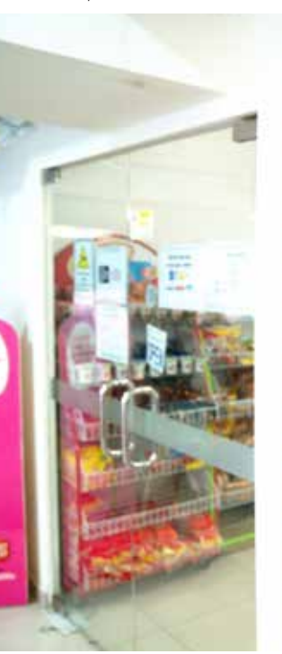
*All pictures shown are for illustration purpose only

Living in a university-provided accommodation is a great way to meet new friends and to be in close proximity to university resources and facilities. At MAHSA, our university residences are on-campus and close to the city centre and areas such as Putrajaya, Subang Jaya, Puchong and Kuala Lumpur with access to the LRT station . Students can also opt to stay in Jalan Universiti Residence at Petaling Jaya.