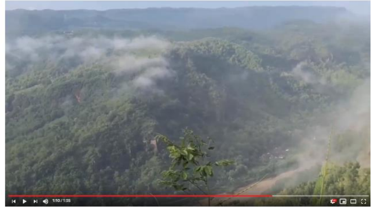
MAHSA #GoGreen Video Competition - Participant #1 127 views