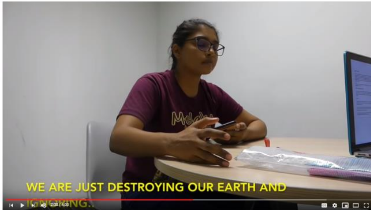
MAHSA #GoGreen Video Competition - Participant #2 374 views