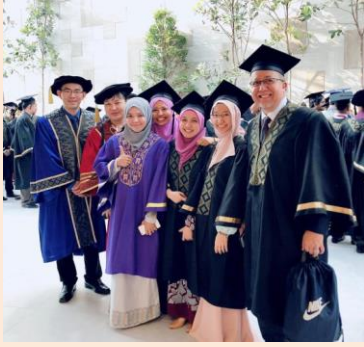
MAHSA Convocation 17-11-18