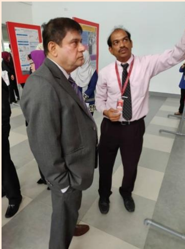
Poster presentation by Faculty of Engineering and IT staff 23-11-18