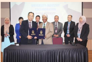
Memorandum of Understanding (MOU) between MAHSA University and Intellogic Technology Sdn Bhd. 26-11-18