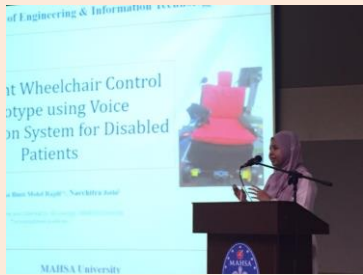
Research Seminar given by Faculty of Engineering and IT staff 22-11-18