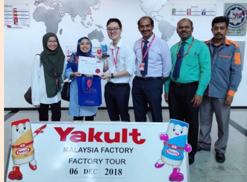
Students Industrial visit to Yakult Malaysia factory, Seramban 6-12-18