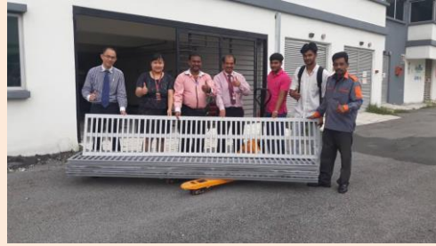
Handing over of Drainage gates to MAHSA Tech. a special project by FEIT-5-12-18