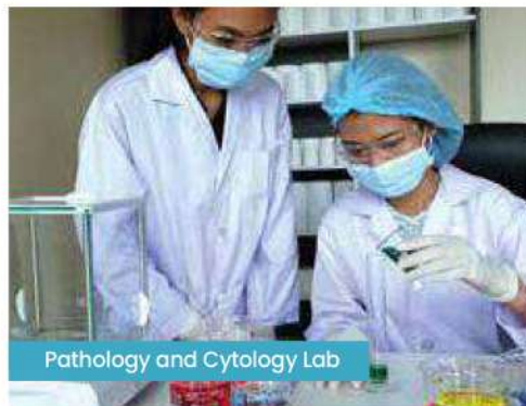
Pathology and Cytology Lab