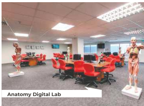
Anatomy Digital Lab