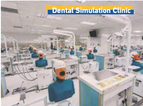
Dental Simulation Clinic