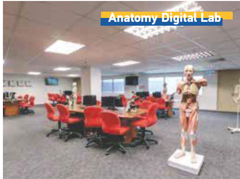
Anatomy Digital Lab