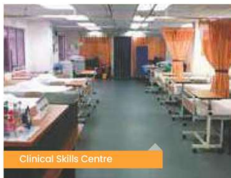
Clinical Skills Centre