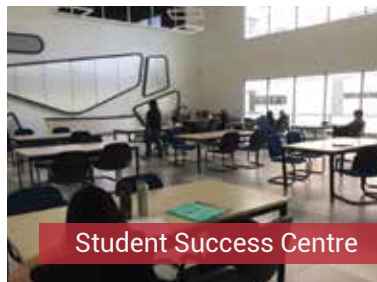
Student Success Centre