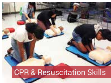
CPR & Resuscitation Skills