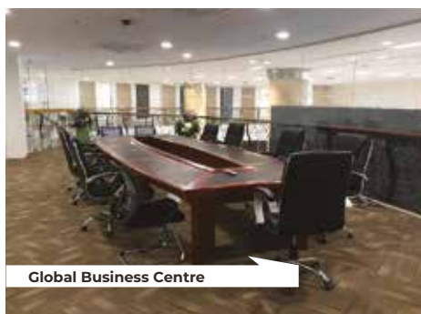
Global Business Centre