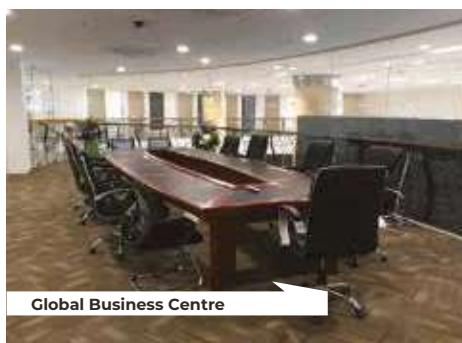
Global Business Centre