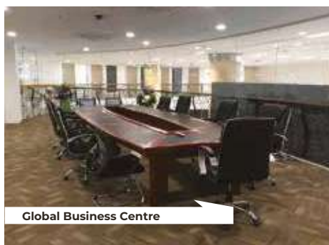
Global Business Centre