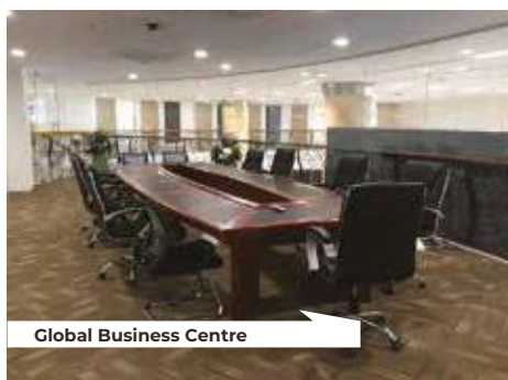
Global Business Centre