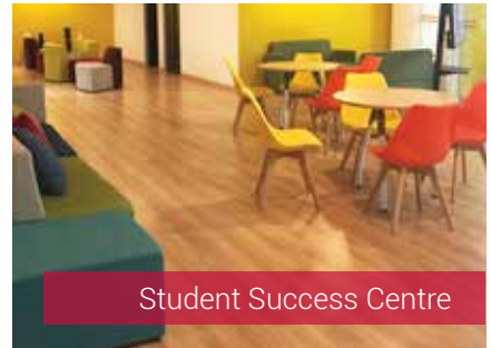
Student Success Centre