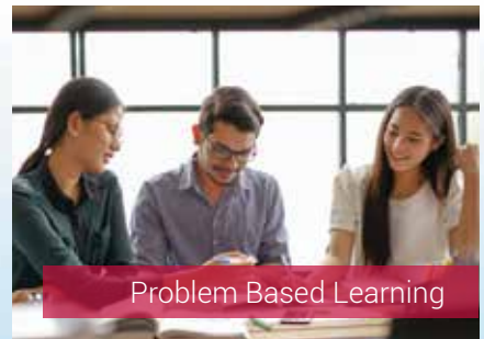
Problem Based Learning