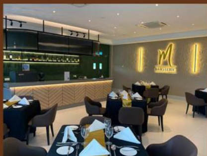
Training Restaurant (M Brasserie)