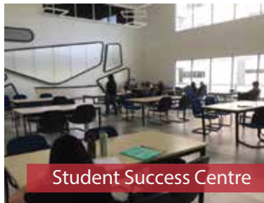
Student Success Centre