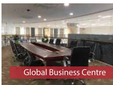
Global Business Centre