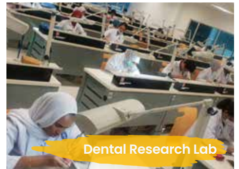
Dental Research Lab