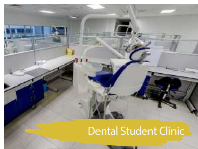
Dental Student Clinic