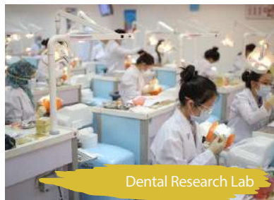
Dental Research Lab