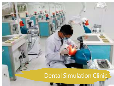
Dental Simulation Clinic