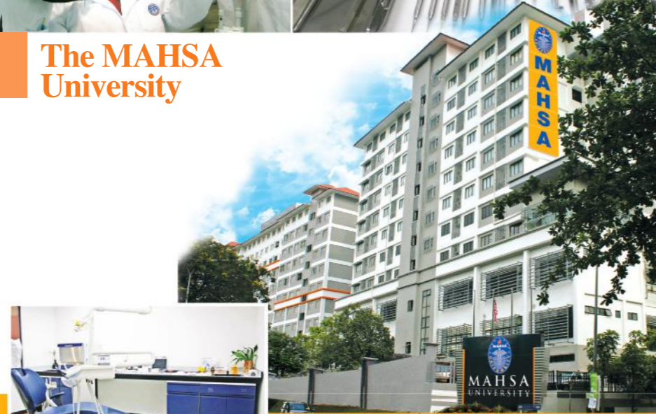
Jalan Universiti Campus Jalan Ilmu off Jalan Universiti, 59100 Kuala Lumpur, Malaysia.