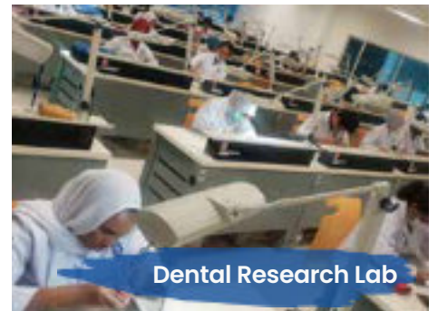
Dental Research Lab