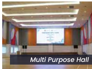
Multi Purpose Hall