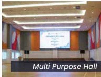
Multi Purpose Hall