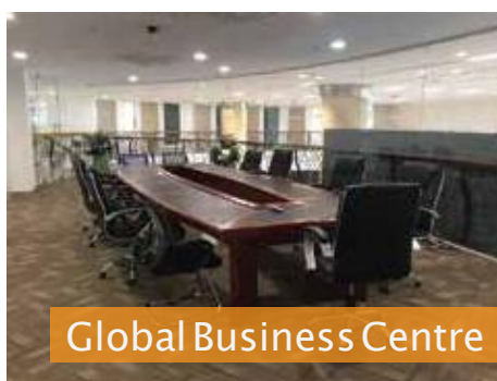
Global Business Centre