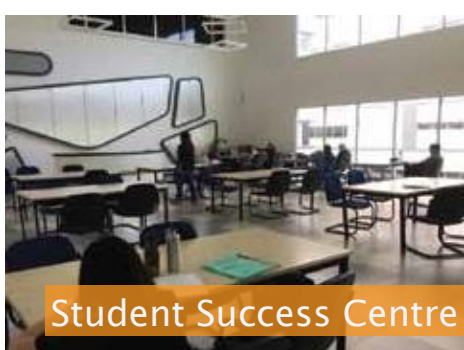
Student Success Centre