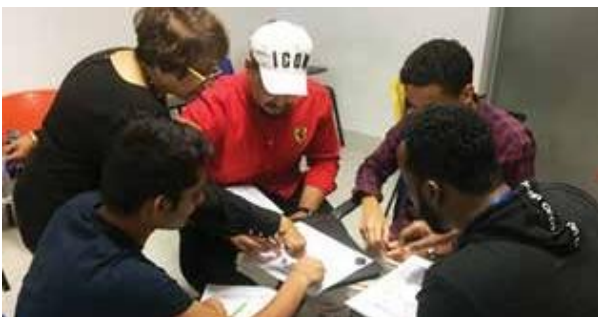
Students working in groups with the lecturer facilitating