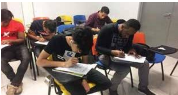
Weekly writing assessments