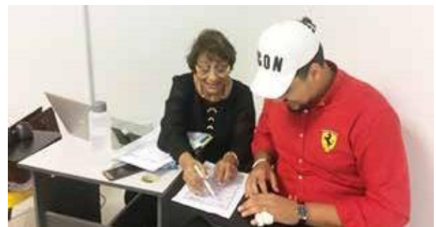
Consultation and personalised attention