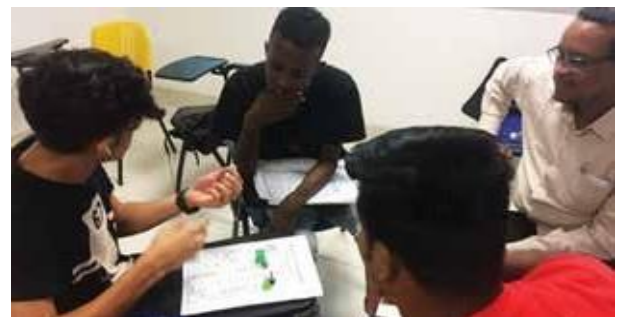
Students engaging in grammar and vocabulary games