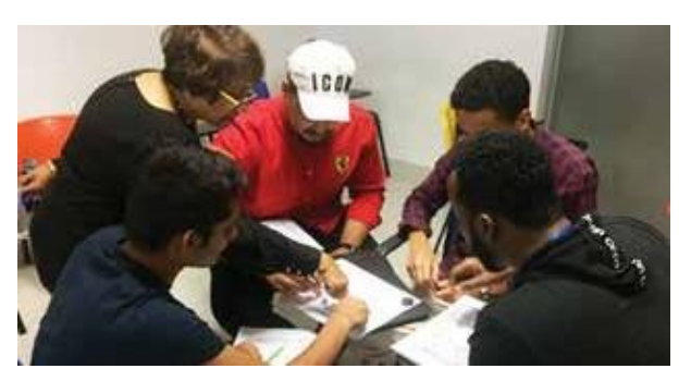
Students working in groups with the lecturer facilitating