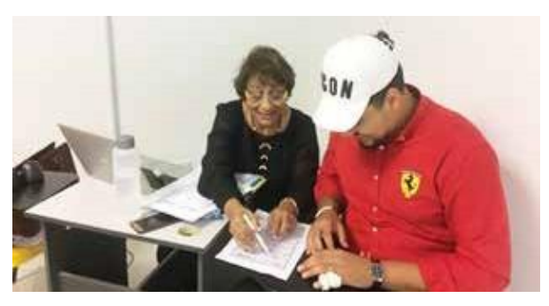
Consultation and personalised attention