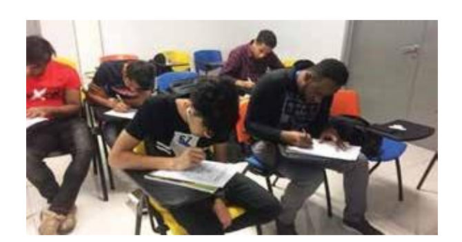
Weekly writing assessments