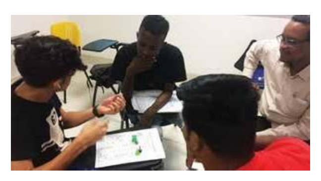
Students engaging in grammar and vocabulary games