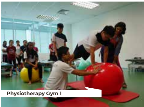
Physiotherapy Gym 1