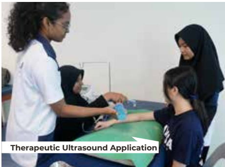
Therapeutic Ultrasound Application