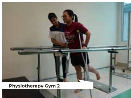
Physiotherapy Gym 2