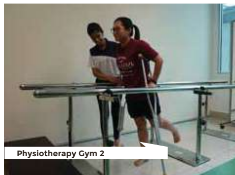
Physiotherapy Gym 2