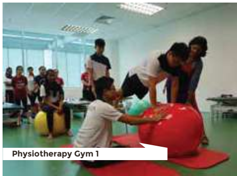
Physiotherapy Gym 1