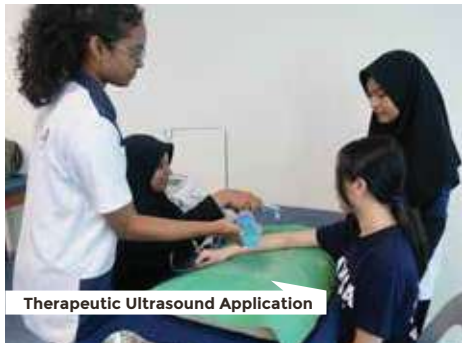
Therapeutic Ultrasound Application