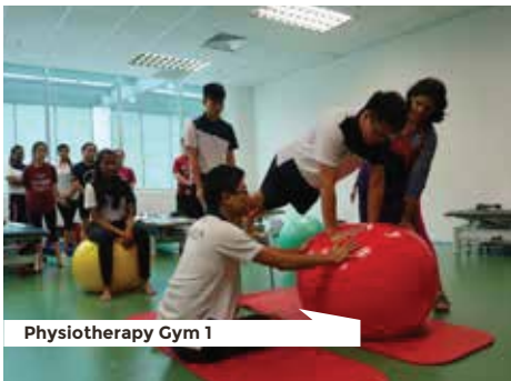
Physiotherapy Gym 1