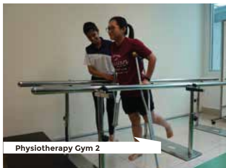
Physiotherapy Gym 2