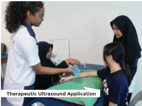
Therapeutic Ultrasound Application