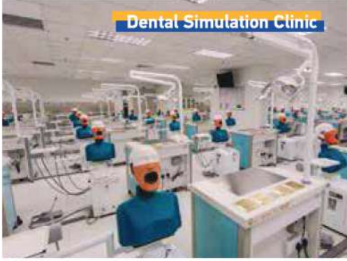
Dental Simulation Clinic