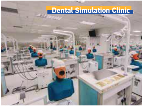
Dental Simulation Clinic