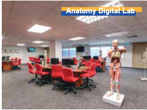
Anatomy Digital Lab