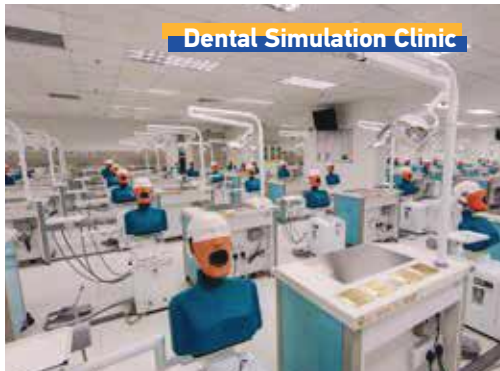
Dental Simulation Clinic