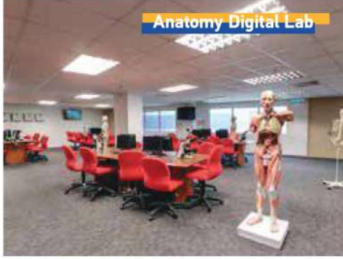
Anatomy Digital Lab